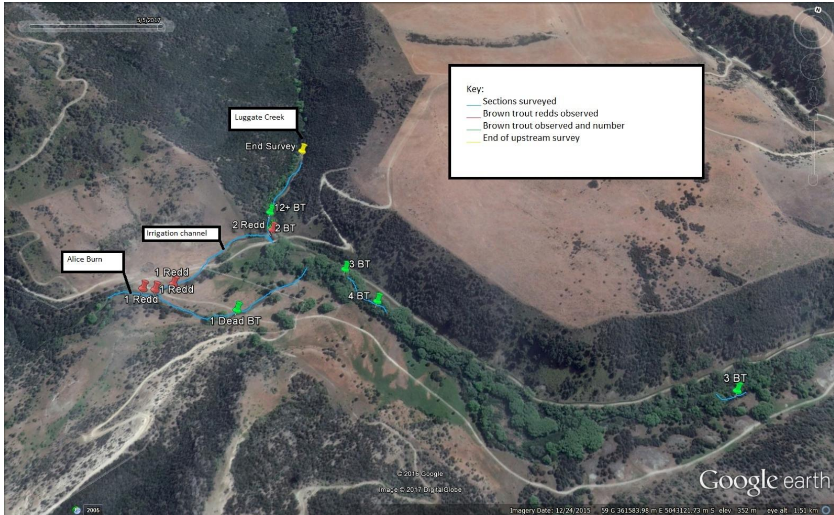
Figure 4. Luggate Creek showing sections surveyed for sports fish spawning activity (blue) (Total 1.13 km) and the location of where brown trout (green) and redds (red) were observed.