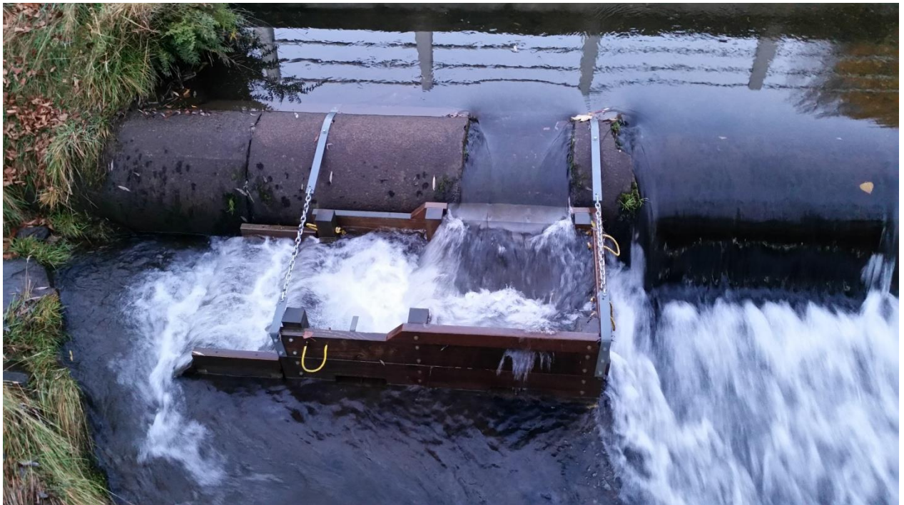
Figure 3. The Luggate Creek fish ladder which was built and installed by local resident Jim Bryson.