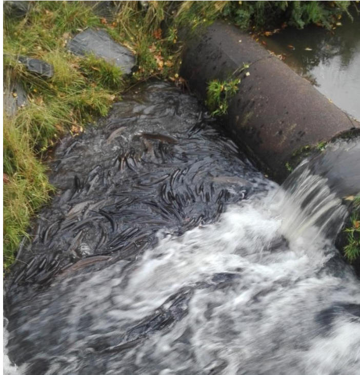
Figure 2. Dozens of brown trout stranded below the Luggate Creek impasse, May 2016.