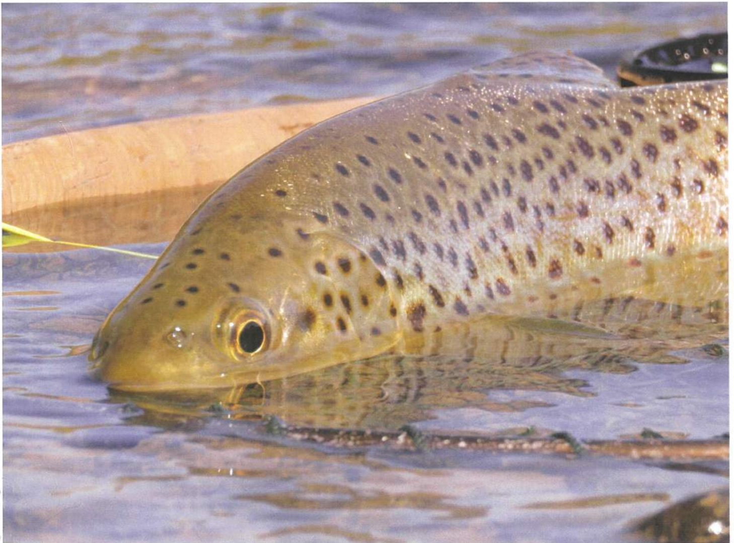
Nice Makarewa River brown trout caught on the fly rod.