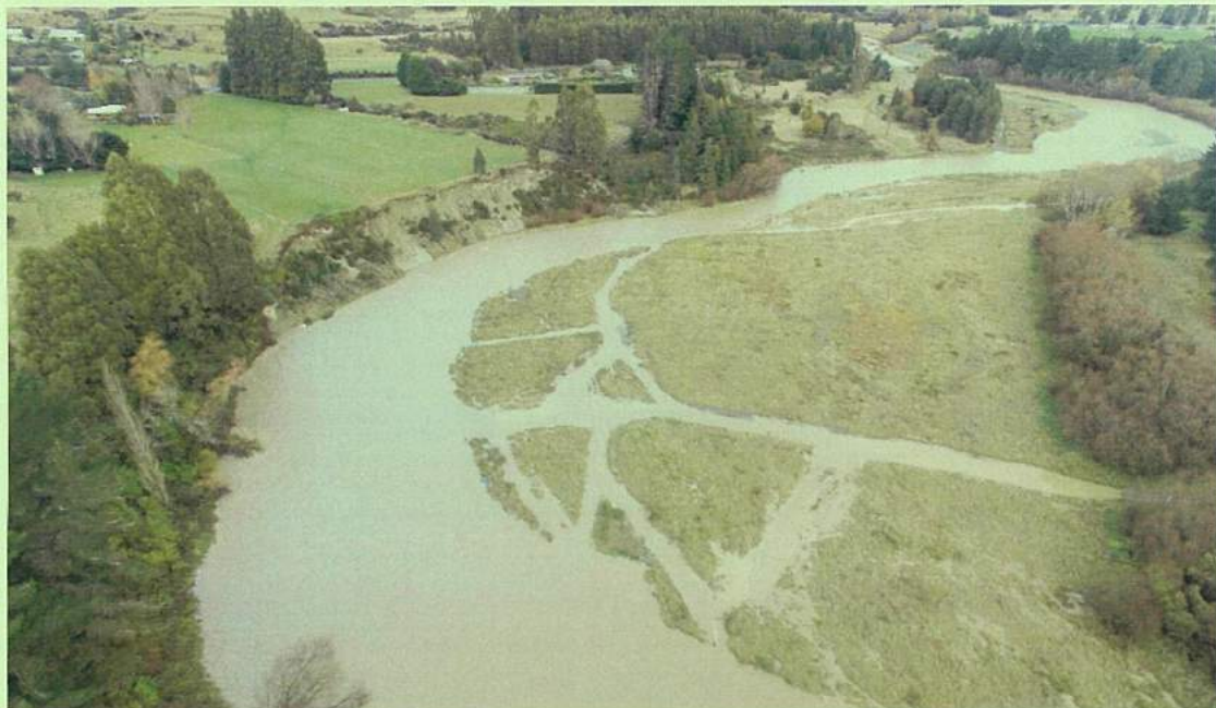
Upukerora River downstream of SH94: floodway elevation, meander confinement and lateral pressure on erodible bank.