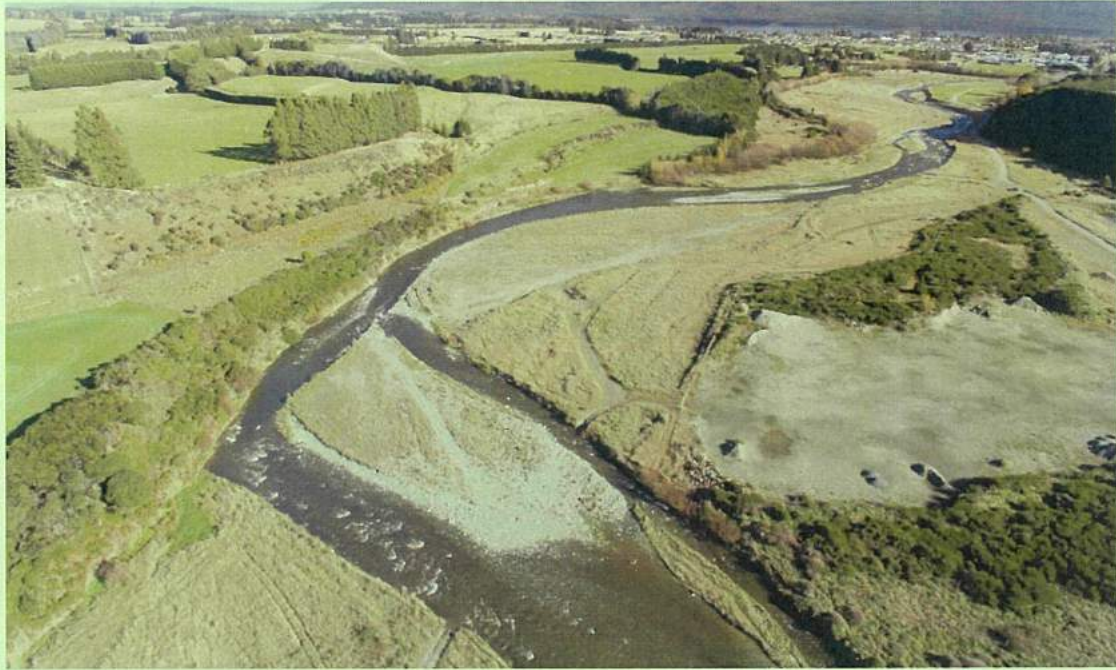
Upukerora River upstream of SH94: bed degradation & confinement and lateral erosion.