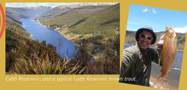
Cobb Reservoir; and a typical Cobb Reservoir brown trout.

Despite the great looking water in the Takaka catchment, trout numbers are generally fairly low, and even the pristine waters of Te Waikoropupu Springs hold few fish. A mix of didymo, regular flooding and seals have had their impact on this once great fishery.