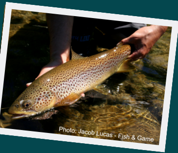
^ A typical Motueka brown trout < Kaiva Paaka with a nice fish