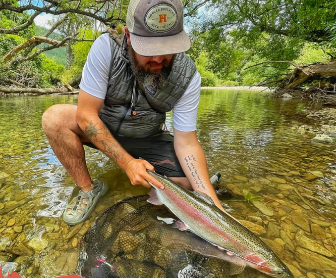
Brought to you by Nelson Marlborough Fish & Game