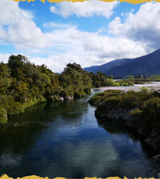
Brought to you by Nelson Marlborough Fish & Game

A guide to fishing in Golden Bay: including the Aorere and Takaka catchments