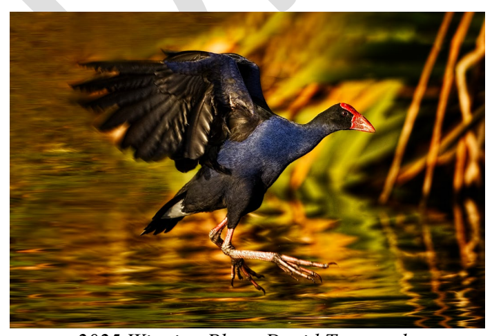
2025 Winning Photo David Towgood