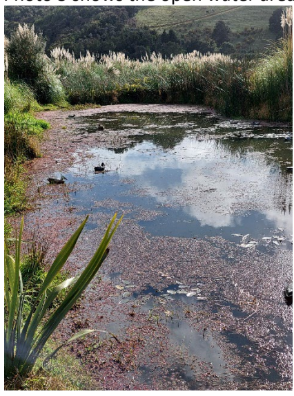
Photo 3 shows the open water area at the north end of the diggings.

Photo 2 shows some of the open water area along the wetland edge with the fencing and some riparian planting shown. This photo was taken from atop one of the spoil piles that was dug out. Photo 4 shows the same area looking from the opposite direction – toward the south.