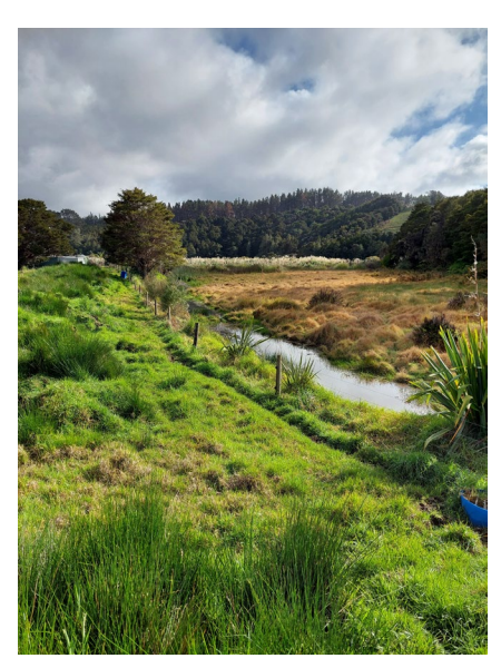
Photo 2 shows some of the open water area along the wetland edge with the fencing and some riparian planting shown. This photo was taken from atop one of the spoil piles that was dug out. Photo 4 shows the same area looking from the opposite direction – toward the south.