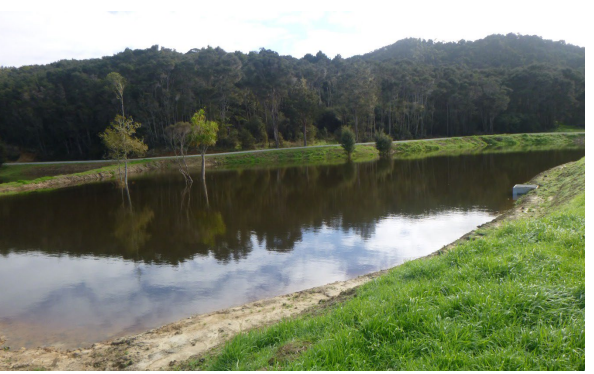
Lower valley weir. Note water control structure, good vegetation cover and well-constructed access road.