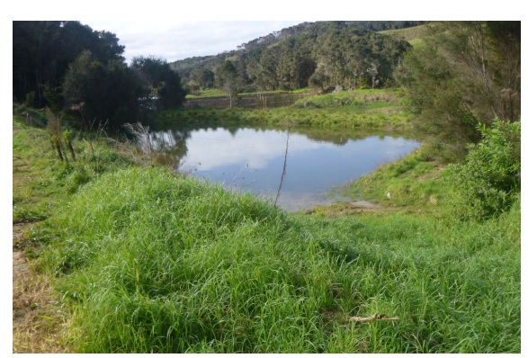
Upper valley weirs, well constructed and re vegetated.

Chris was delighted to note how the wetlands have become havens for wildlife with game birds, native species, eels etc now well established. "I am confident as the planting undertaken over the last two winters becomes more established that this will be one of Northland's wetland habitat gems".