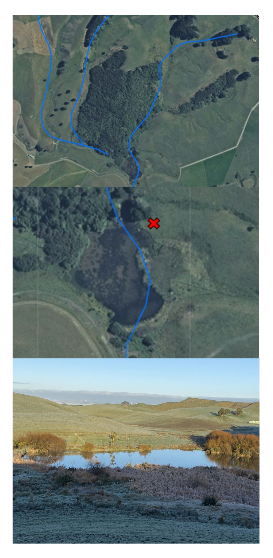
2. The water depth in the middle of the pond reaches 1.5-2 metres. However the base of the pond does go a bit deeper but is a layer of thick mud.