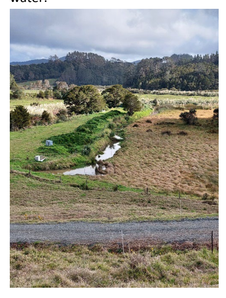
Photo 1 shows the works from an elevated position – the grass peninsula entering the frame from the left sits between the project area and the Waikare Creek (creek shown by line of toe toe). Both sides of the grass peninsula have been fenced off to stock and some riparian planting has been done. You can see the open water areas that have been created along the wetland edge and can also see the piles of spoil (covered over by darker green Juncus rushes) that were dug out to create open water.