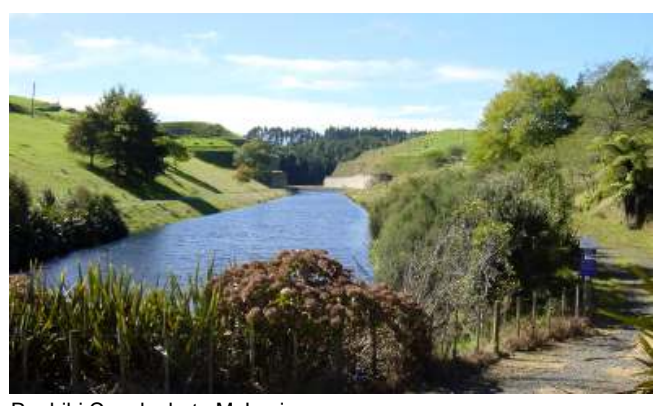
Ruahihi Canal

Lake McLaren is an ideal location for family picnics and introducing youngsters to the joys of trout fishing.