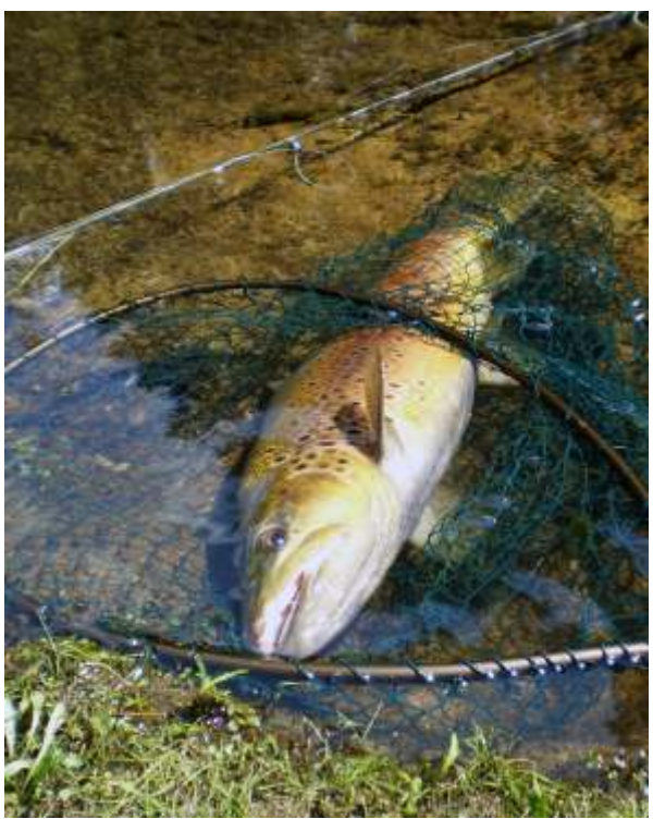
Ngamuwahine brown

Access is off Crawford Road, from Wairoa Rd and SH2 near Bethlehem and through private property (seek landowner permission). This small, appealing tributary of the Wairoa is ideal for fly fishing with dries and nymphs. Pools are well formed and separated by riffles and small cascades. Trout average 0.5kg.