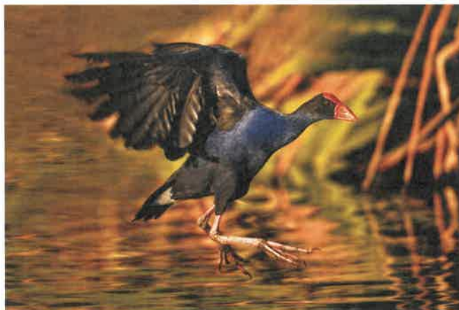
2025 Winning Photo David Towgood