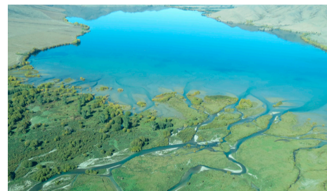
The delta of the Ahuriri River

2 Continue on SH 83 through Otematata climbing the Otematata Saddle where an elevated view of the Ahuriri Arm