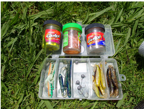
perch soft bait and baits.