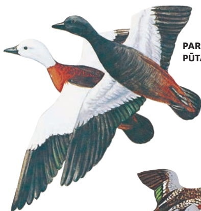
PARADISE SHELDUCK/ PŪTAKITAKI